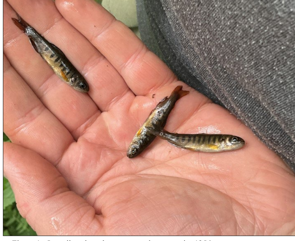
Figure 1.-Juvenile coho salmon captured at waypoint 1256.