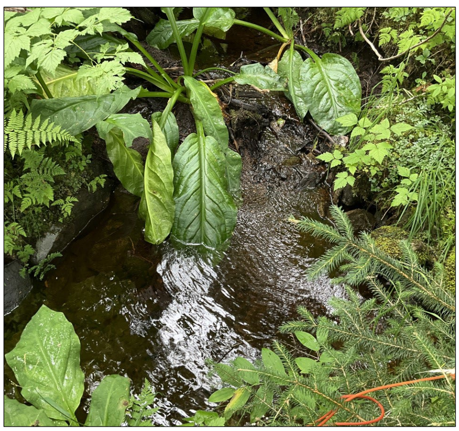
Figure 2.-Channel at waypoint 1256.