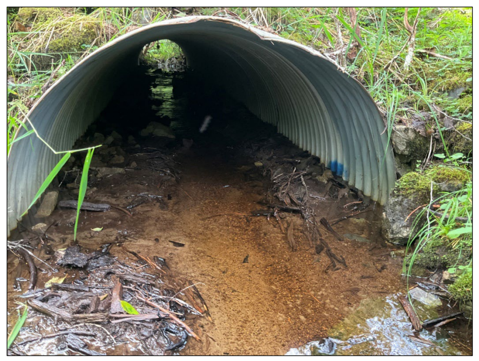
Figure 3.-Culvert at waypoint 1256.